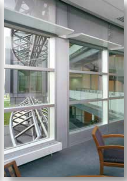
Interior light shelves

Choosing efficient windows for a commercial building can be difficult, using published U-Factor, Solar Heat Gain Coefficient, Visible Light Transmittance, and Condensation Resistance Factor, as relative importance depends on site- and building-specific variables.