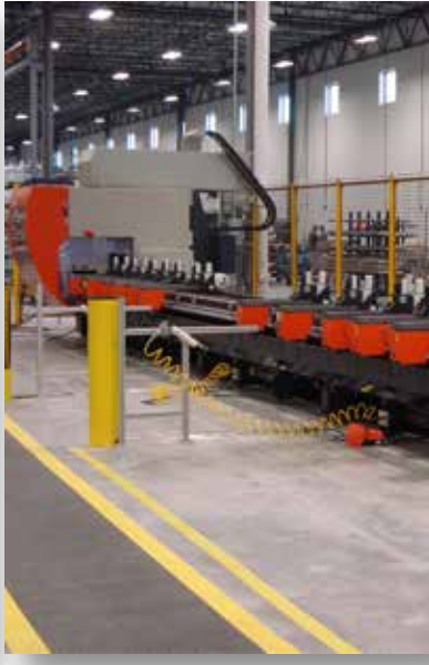
CNC Machining Center